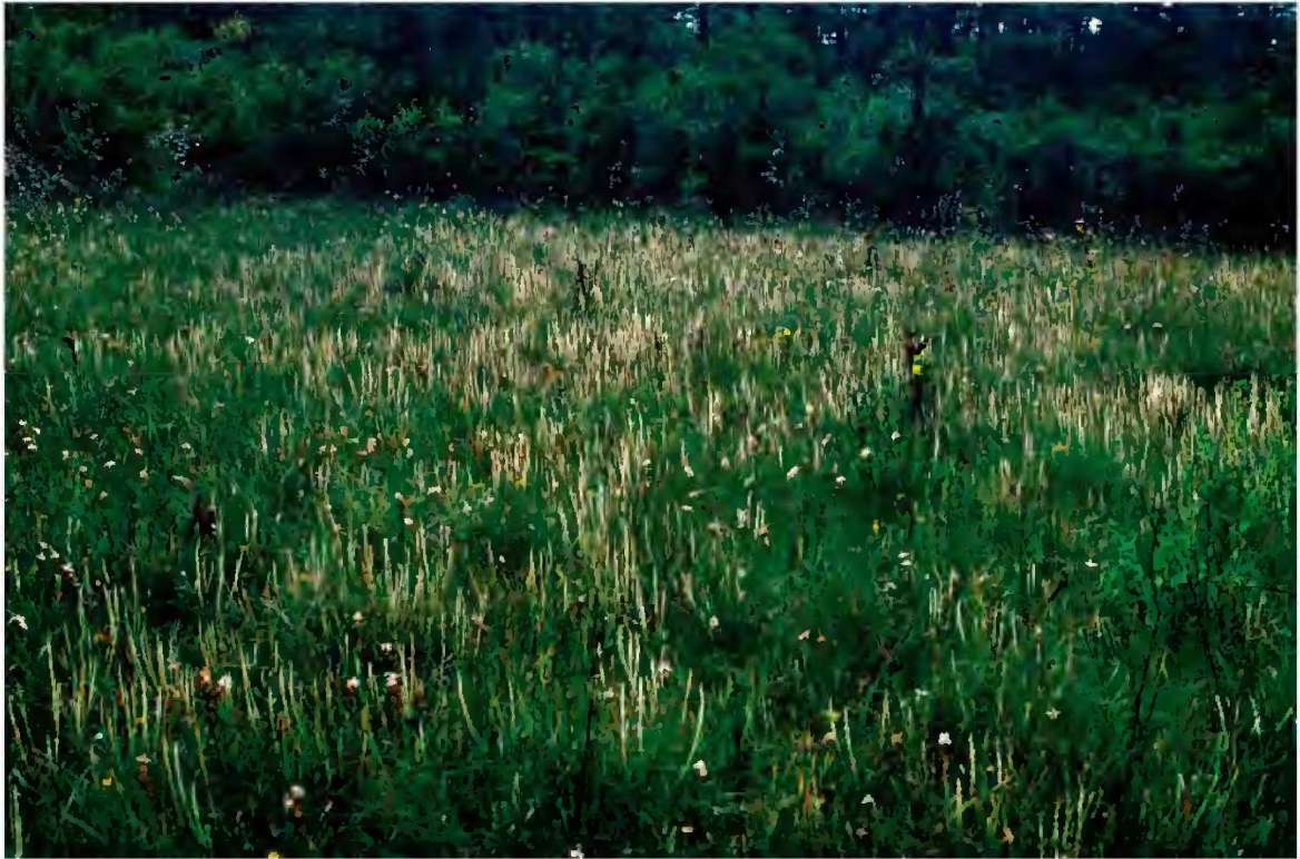
Figure 6: A familiar view of Drosera tracyi , backlit in the evening sunset (Liberty County, Florida).

different species concepts may come to different conclusions, and I do not fool myself into thinking I have had the last word on the subject of the two thread-leaf sundews. As Peter Taylor (1989) wrote, “Nothing is perfect, except perhaps the plants that we study and attempt to understand....”